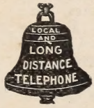
In our office